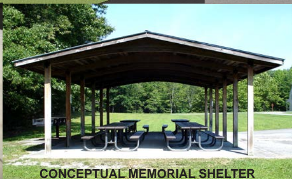
CONCEPTUAL MEMORIAL SHELTER