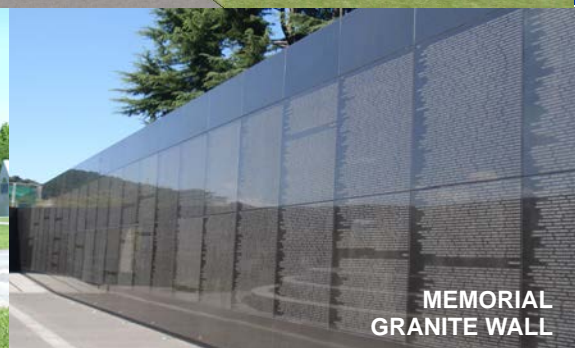
MEMORIAL GRANITE WALL