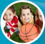
SCHOLARSHIPS FOR KIDS